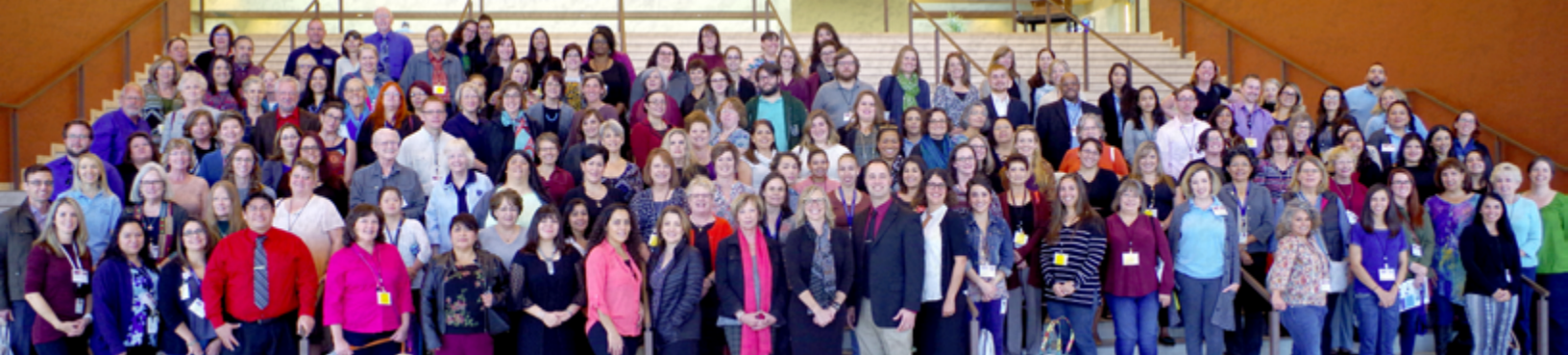
GREETINGS FROM THE 170 STAFF, 15 FACULTY, AND 24 STUDENTS/ON-CALLS AT THE CDD!